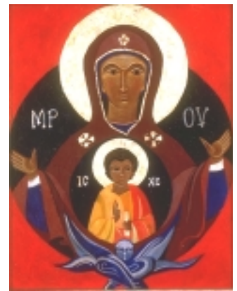
Mother of the Sign egg tempera on wood with 18k gold leaf Shevchenko/Goncharev Collection