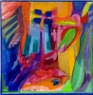
Forest Song montype